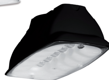
HBI Bisscheroux B.V. 2L05--CC--- Polarem CC / LVK (polair)