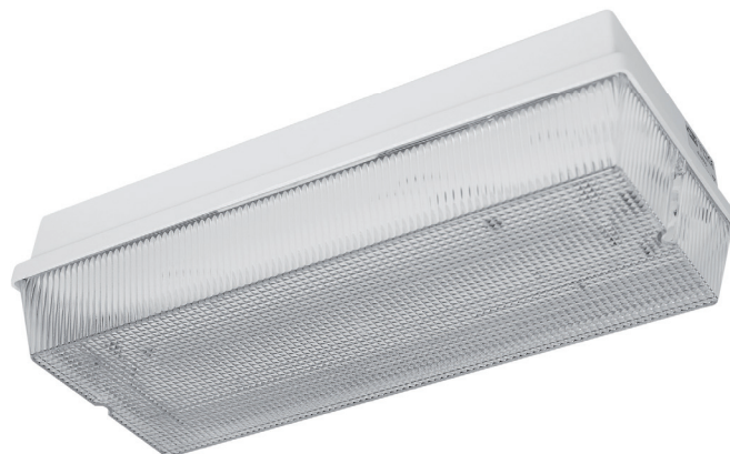
HBI Bisscheroux B.V. 4L06---- 400 Economy / LVK (polair)